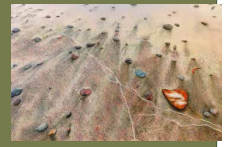
Leane Bettin, Pebbled Beach, Oil on canvas, 2014

For more information, visit stmcollege.ca.